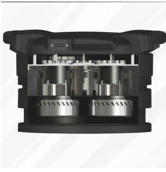
BY-PASS MOTORS Efficient By-pass motors