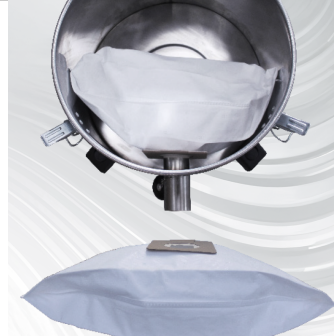
COLLECTION Disposable filter bag