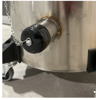
SAFETY Safety cap for transport