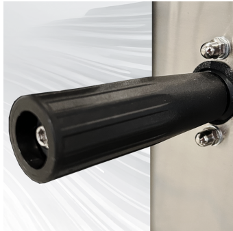
CLEANING Manual shaking cleaning