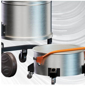
EMPTYING Collection system with 20l barrel