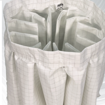
FILTRATION Primary stellar polyester filter