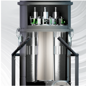
FILTRATION 3-cartridge aluminium filter + HEPA (optional)