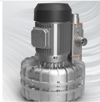
ENGINE 5,5 KW Turbine