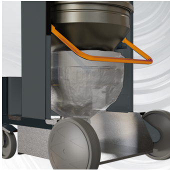
INTERCHANGEABLE With Longopack continuous bag