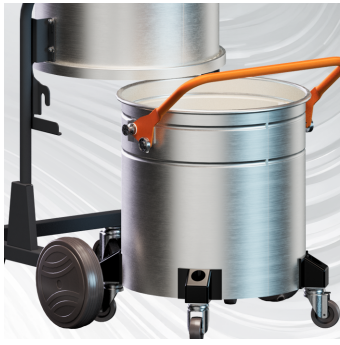
COLLECTION Collection system with 50L tank