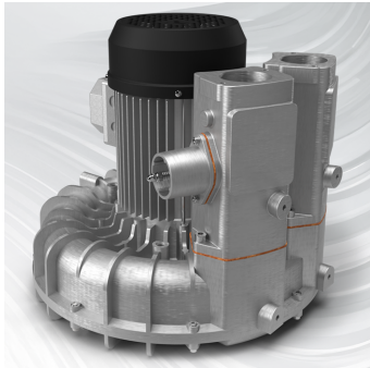
ENGINE 2,2 - 3 - 4 KW Turbine available