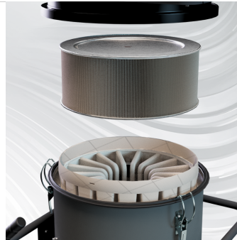
PULIZIA FILTRO Filtro in poliestere + HEPA (opzionale)