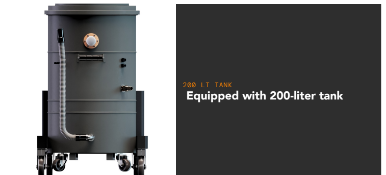
200 LT TANK Equipped with 200-liter tank