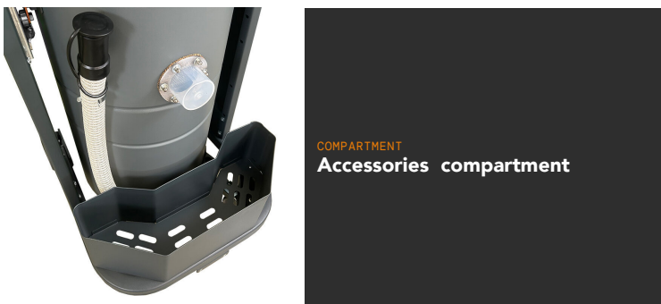
COMPARTMENT Accessories compartment