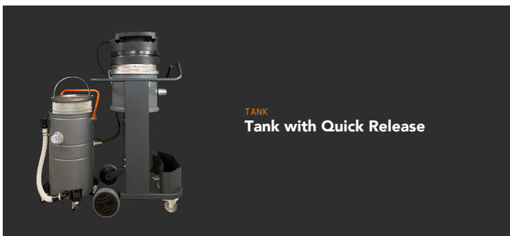
TANK Tank with Quick Release