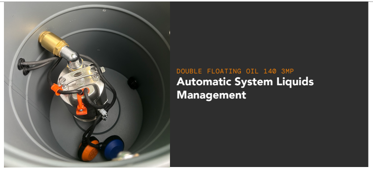
DOUBLE FLOATING OIL 140 3MP Automatic System Liquids Management