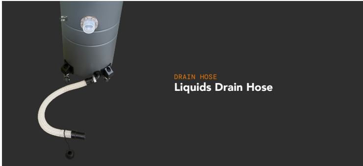
DRAIN HOSE Liquids Drain Hose