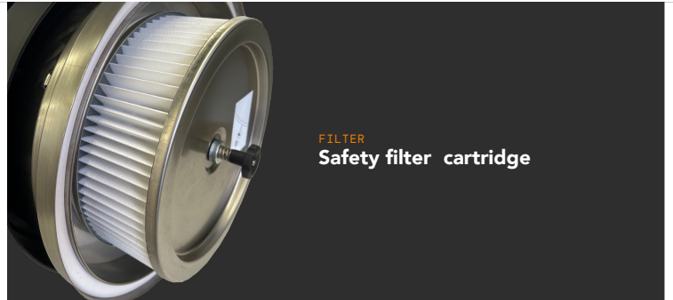
FILTER Safety filter cartridge