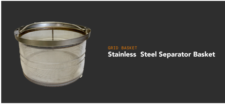
GRID BASKET Stainless Steel Separator Basket