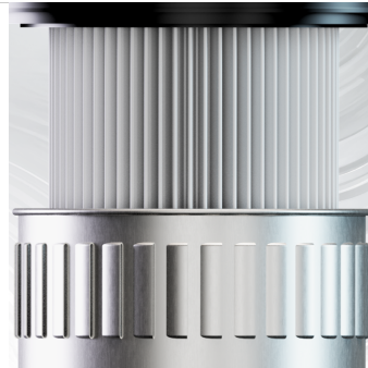
FILTRATION Cartridge filter aluminized