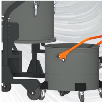
EMPTYING Collection system with 35l barrel