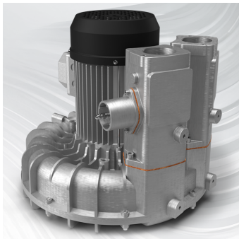
ENGINE 2,2 - 3 - 4 KW Turbine available