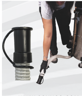
EMPTYING Discharge liquids hose